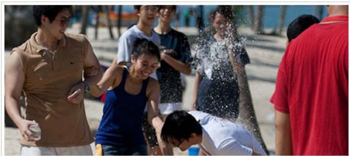
Two campers protect their comrade from an impending water bomb attack.