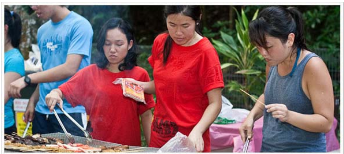
Volunteers barbecue food in preparation for campfire night.