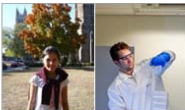
Singaporeans in America