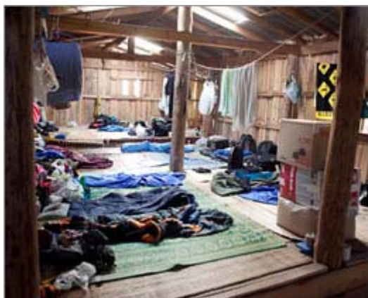
Our living accommodation in Chiangmai - Sleeping bags in wooden stilt houses.

At HKL village, we successfully conducted several important public health measures. We designed health record books to chart the anthropometric data of the children and maintain their health records such as vaccination schedules. The HKL children were found to have high incidences of hair lice, dental caries and skin conditions. Thanks to the care and generosity of Duke-NUS staff and students, we also had eight large boxes of toys in our possession. Toys are luxury items for HKL children. Their innocent eyes lit up with delight and excitement as we distributed them. At the same time, we were amazed at how polite and orderly they were during the toy distribution.