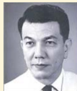
Benjamin Henry Sheares

Dr. Benjamin Henry Sheares (1907-1981) was most notably the second President of Singapore. Beginning his career in Obstetrics and Gynaecology in 1931, he later became the first Singapore-born doctor to be appointed Professor of Obstetrics and Gynaecology at the King Edward VII College of Medicine. He was also the first Singaporean obstetrician to qualify as a member of the Royal College of Obstetricians and Gynaecologists in England. Dr. Sheares also pioneered the Lower Segment Caesarean Section, which is now the gold standard and used extensively today. He also created the vaginoplasty surgical procedure, which was named after him, and became internationally recognized after he published a paper on it in 1960.