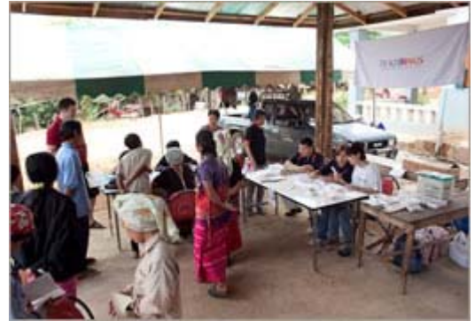
Stream of patients on day of health screening.

Quoting Oscar Wilde: "The smallest act of kindness is worth more than the grandest intention." Project KAREn was one of the most fulfilling experiences I could ever have had during my Duke-NUS years. It taught me so much and I will never forget the beautiful memories and strong friendships forged in HKL village.