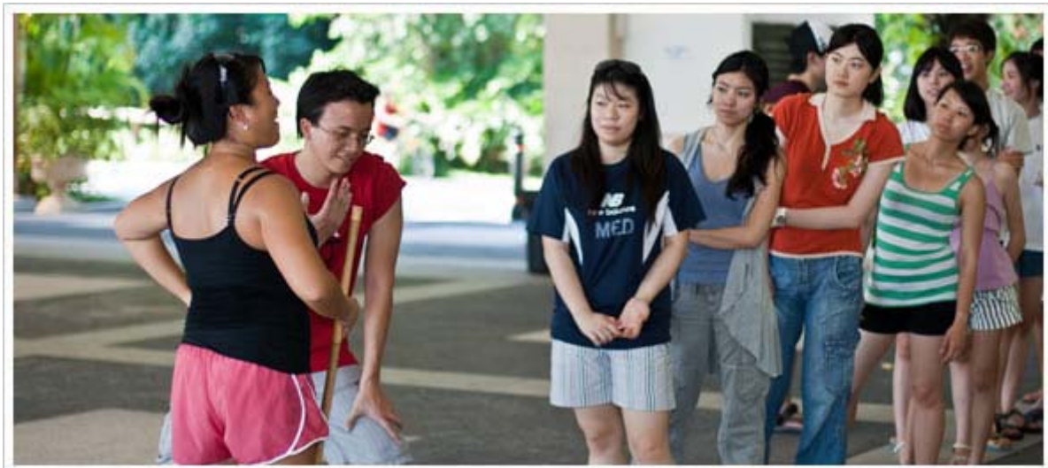
Volunteers try out the games during a dry run prior to the camp.

All in all, Camp Simba was a marvellous success thanks to the enthusiastic participation of the children, the volunteers (who served in a variety of roles), and support from Duke-NUS, YLL SoM and SingHealth.