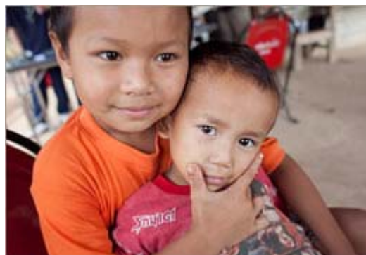
HKL children waiting for games to start.

On our first trip, we sponsored a lunch for the children of the primary school. This "special" lunch which included chicken and eggs was a treat for these children. This is because their normal meals typically consist of rice and soy bean paste. We could sense their gratitude and joy as they tucked in happily. At the school, we also had the chance to interact with the teachers who showed us their traditional way of hair lice eradication which involved mashing up apple custard leaves and alcohol into a paste and applying it on the hair of affected children for 20-30 minutes.