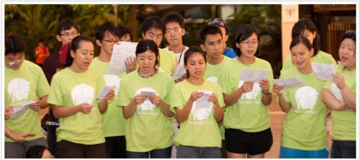
Volunteers and children belt out songs from The Lion King.