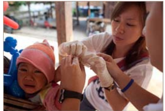
First-aid for an infant with a bleeding finger.