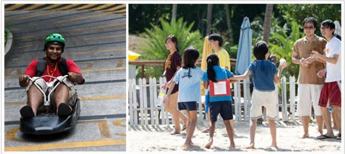
Activities during the camp included beach games and the Luge ride.