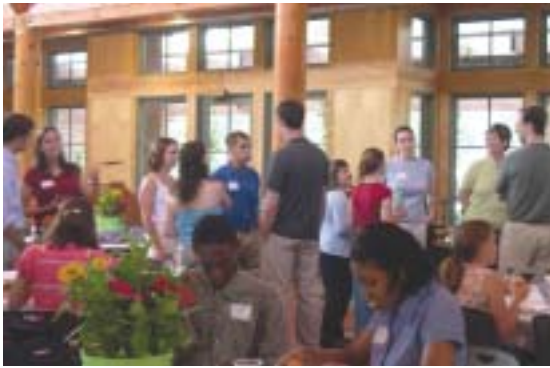
Members of the Class of 2007 get to know one another as they enjoy their August 7 orientation picnic.

The Duke Medical Class of 2007, the first to participate in the new DukeMed Alumni-Student Link mentoring program, attended their student orientation picnic on August 7.