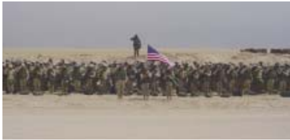
Comrades salute as 28th CSH leaves Kuwait

The Iraq War was Croll's second deployment. On his first, he arrived in Bosnia on the morning of September 11, 2001. Most of that deployment was spent locked down on base, practicing maneuvers and staying in shape. But it was an ominous sign for the future.