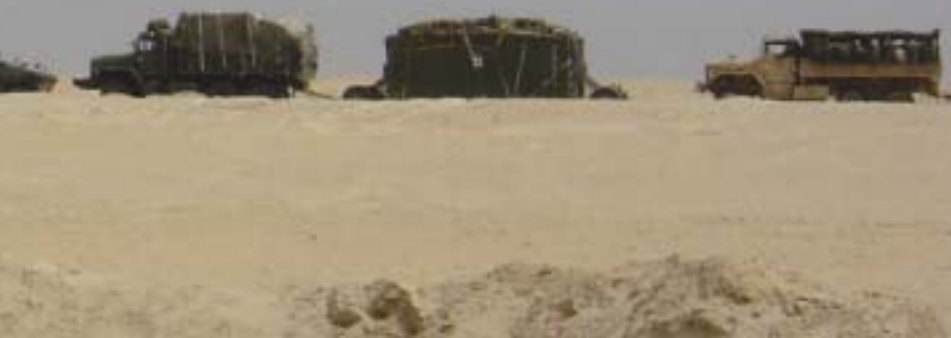
Enroute to Baghdad

"I don't like war," he says. "It's shocking and tragic. But I'm glad that I can help improve care for our soldiers." 🇺🇸