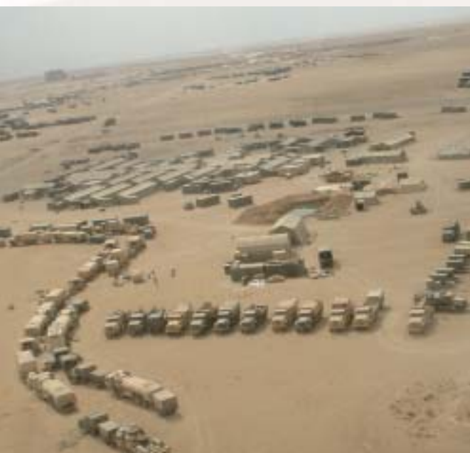
The 28th Combat Support Hospital in Iraq