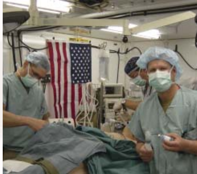
The operating room