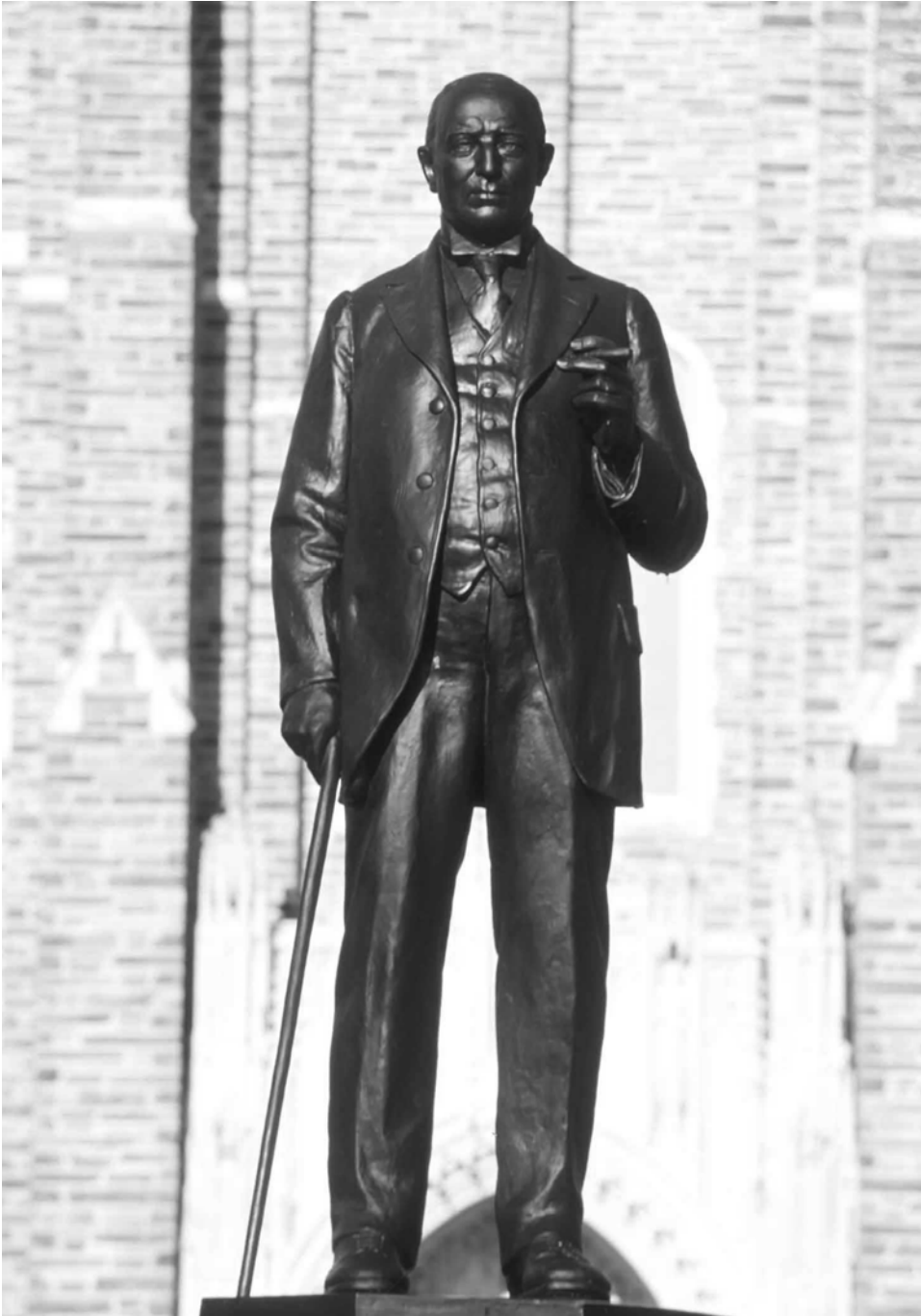
James Buchanan Duke