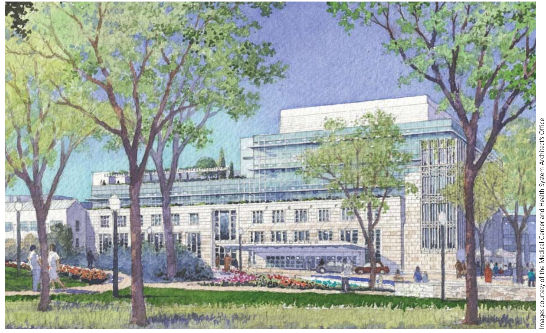
A rendering of the new Duke Medicine Cancer Center.