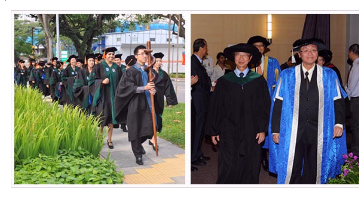
Duke-NUS graduands on their procession from campus (left) and upon entering the celebration venue in the Ministry of Health auditorium with the rest of the key faculty and VIPs (right).