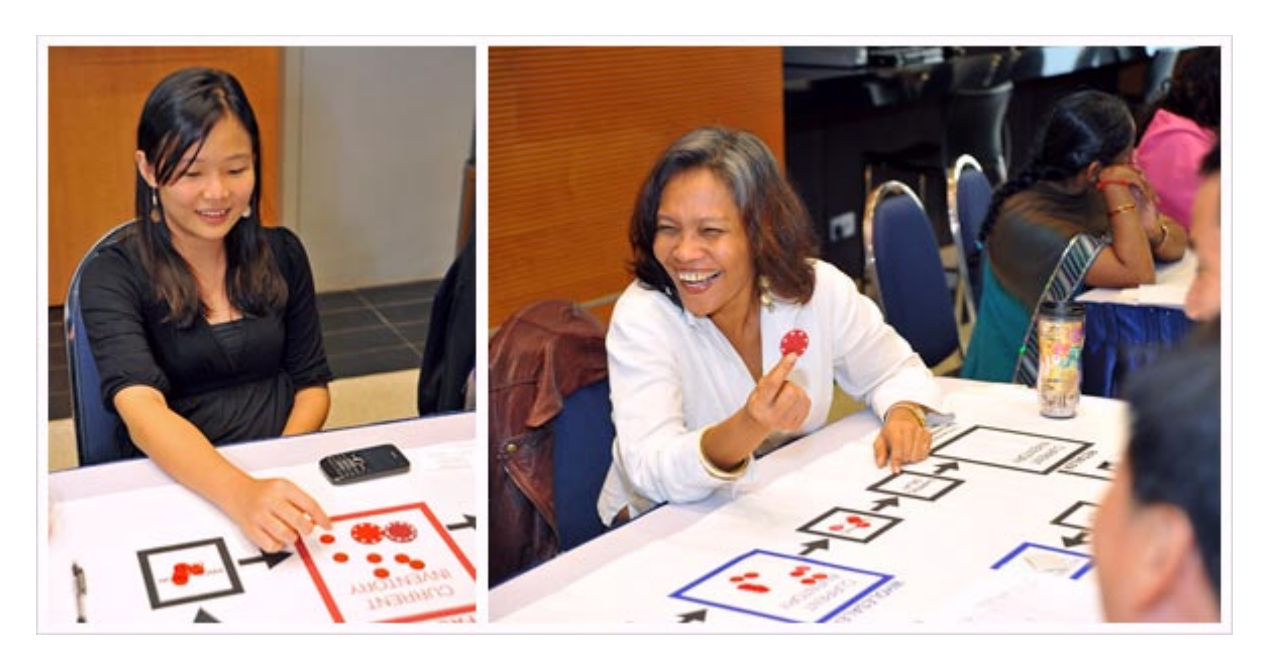
Players debate and contemplate the best strategies.