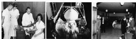
Education Technology & Research Clinical Care