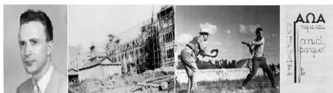
People & Groups Buildings & Construction Events & Recreation Publications

The Foundations of Excellence archival image project, funded by The Josiah Charles Trent Memorial Foundation, Inc., presents a selection of over 600 digitized photographs and publications. These images document the history of the Duke Medicine's academic, clinical, and research activities from 1927 through 1950. All materials included in this collection are available in Duke University Medical Center Archives.