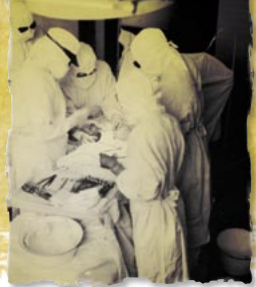
Hart's Surgical Gowns Protect Against UV Exposure