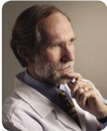
Peter C. Agre, MD

In 2003, Agre shared the Nobel Prize in Chemistry for revealing the molecular basis for the movement of water into and out of cells.