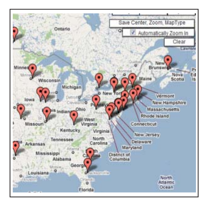
TIP: To repurpose charts of the survey responses, use screen capture software, or use your Print-Screen button to do a screen capture and then paste it into your destination.

To get started you just need a free Google account, which can be created online at http://www.google.com/ accounts/newaccount . Your respondents do not need Google accounts to answer your survey questions.