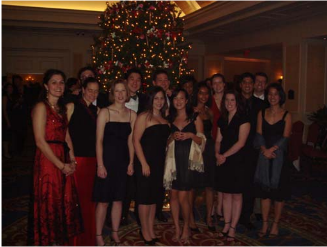
Medicine Holiday Party 2008