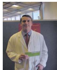
James Browne Orthopaedics