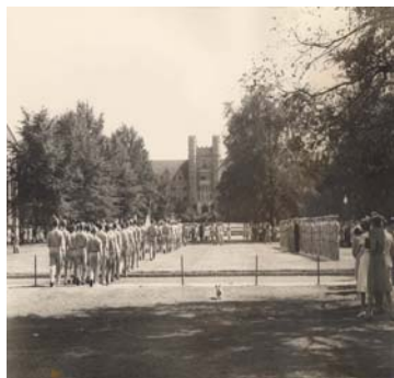
Archives Exhibit Photo: Members of the 65th General Hospital