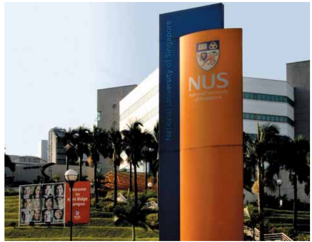
National University of Singapore at Kent Ridge, Singapore.