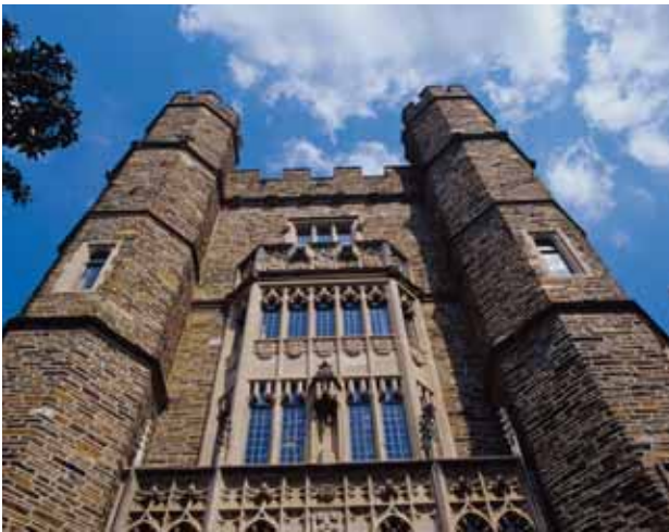
Duke University in Durham, North Carolina.

“ Duke-NUS offers a graduate-entry, four-year medical program based on the unique Duke model of education, with one year dedicated to independent study and research projects of a basic science or clinical nature. ”