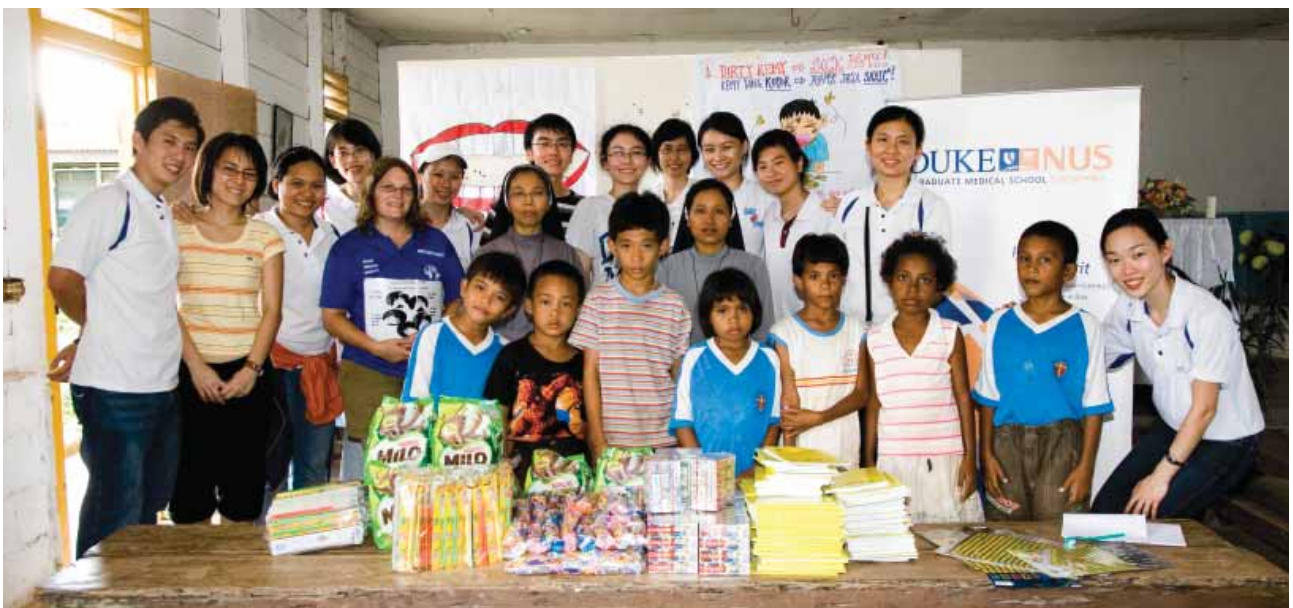
Students' Community visit to Rempang, Indonesia.

On May 2 & 3, 2008, nine Duke-NUS students from the Class of 2011 participated in a community service trip to Rempang, Indonesia to visit underprivileged children at the Asrama Santa Theresia School. The two days were spent teaching the children about good dental hygiene as well as reviewing basic health care tips with the school children's parents.