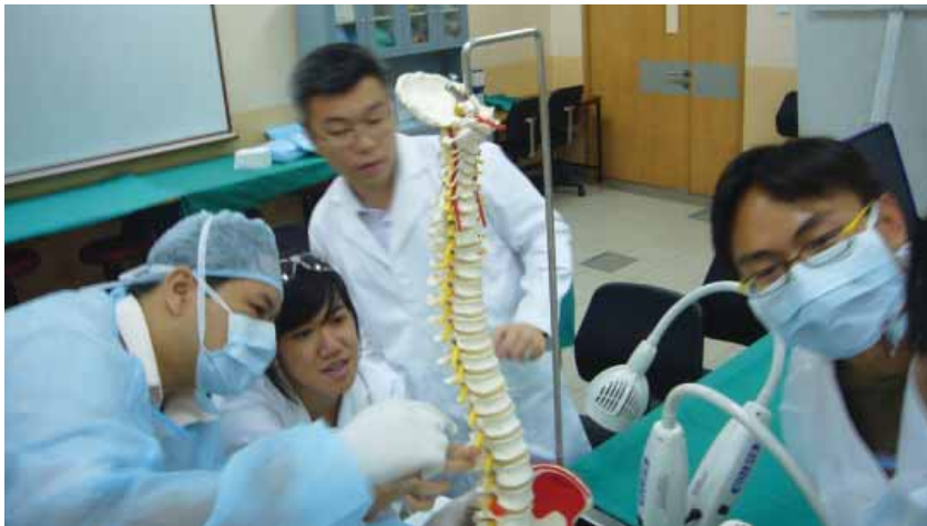
The Class of 2011 taking the Normal Body Course, taught in Year 1.