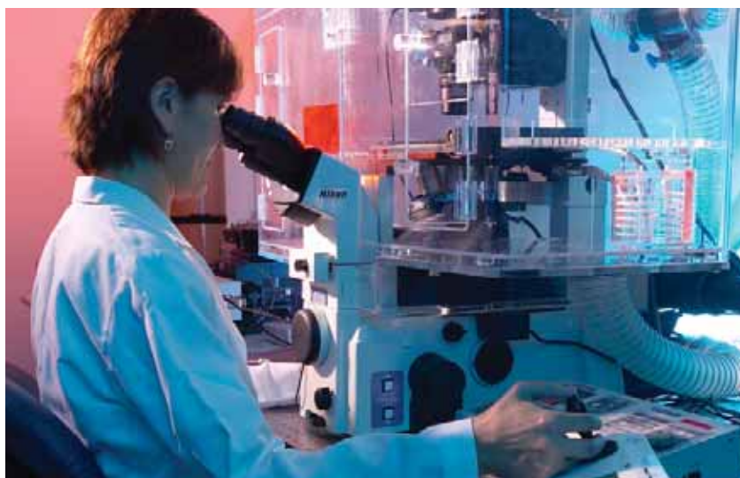
Our faculty and students have access to some of the world's most sophisticated biomedical research facilities.

The Health Services Research (HSR) Program is the most recent of the Signature Research Programs incepted at Duke-NUS. The HSR Program will establish strong links with researchers in Singapore and in the region. Within Singapore, such linkages are already being forged with the Ministry of Health, the SingHealth and the National Health Group clusters, the National University Health System, and the Lee Kuan Yew