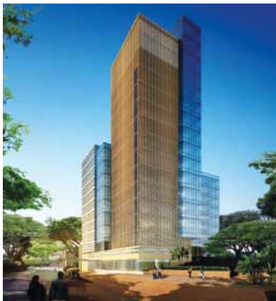
The new Khoo Teck Puat Building on College Road, located within the Outram Campus.

This is in addition to the Lee Foundation's gift to establish the Lee Kong Chian Professorship in Cardiovascular Research.