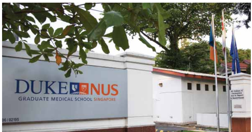
Our interim campus along Jalan Bukit Merah.

A graduate medical school was just what was needed to produce the highly trained physician-scientists needed