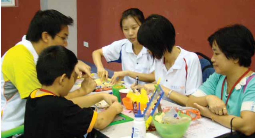
The students doing their bit at the SGH Community Day.