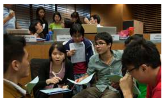
Students deep in discussion during a TeamLEAD session