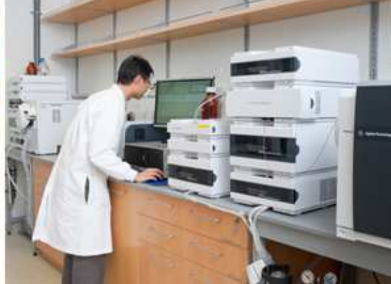
The gas chromatography-mass spectrometer separates volatile compound mixtures then detects the compounds by creating a mass spectrum of each compound.