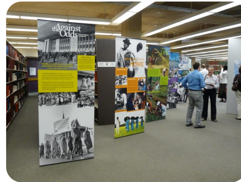
Global Health Exhibit