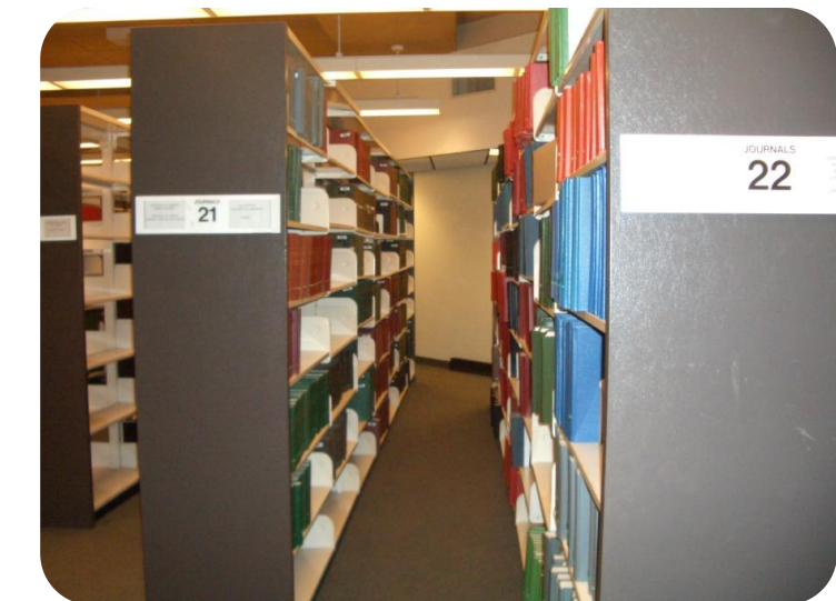
Old Stack Area