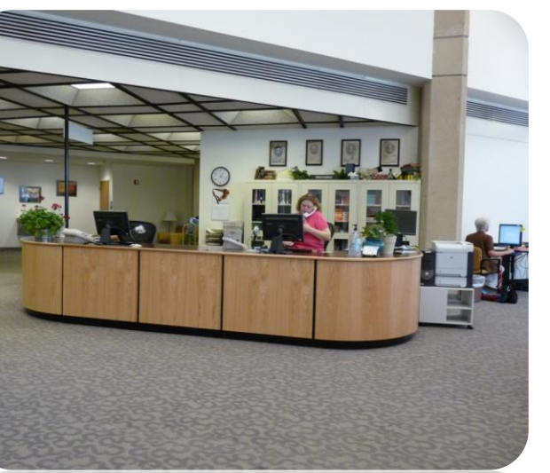
New Service Desk