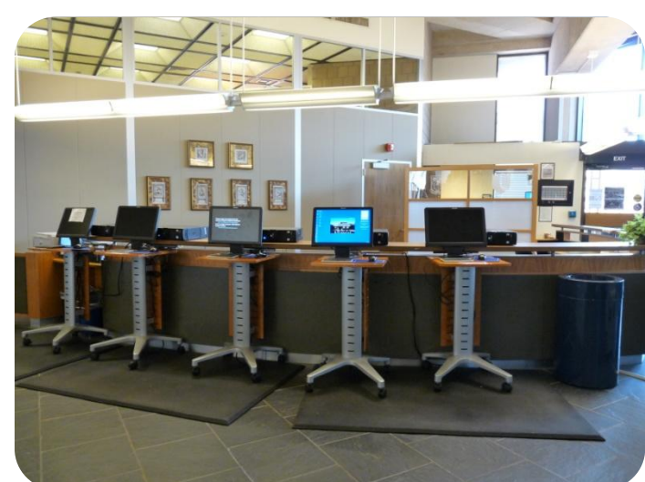
Old Service Desk Repurposed