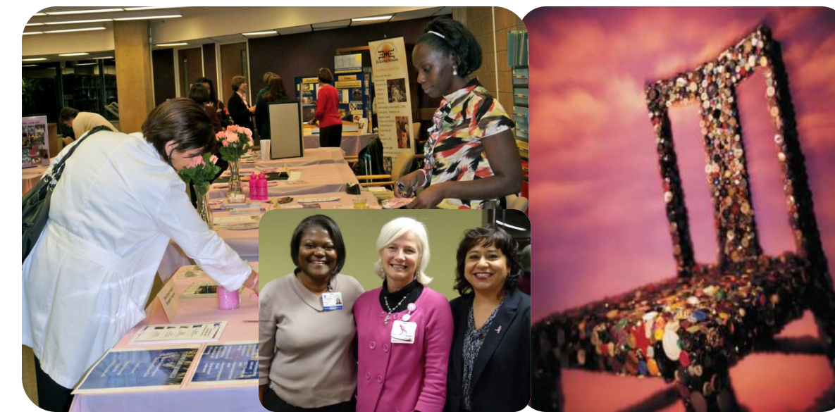
Breast Cancer Awareness