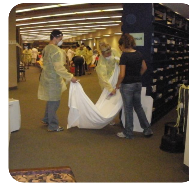
SOM Clinical Core Disaster Drill