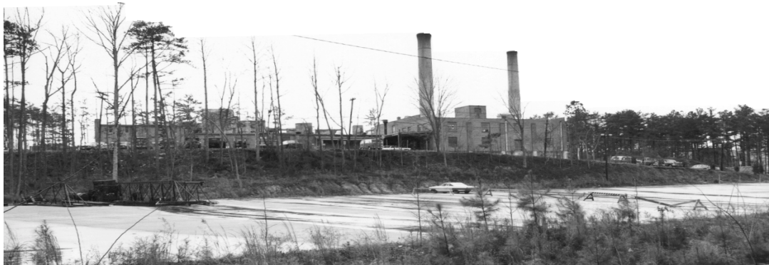
This photograph was taken on February 3, 1973, showing the parking lot that was to become the site of the Seeley G. Mudd Building and the Medical Center Library.

We have already heard from many people that the green snake chairs should be kept, the striped carpeting needs to go, and a coffee shop would be a great addition. But if you have other ideas, you can leave them on a post-it note on the exhibit in the main lobby or send them to me at thibo001@mc.duke.edu . So please stop by our displays and help us celebrate our 25 th building anniversary, as well as plan for the next 25 years!